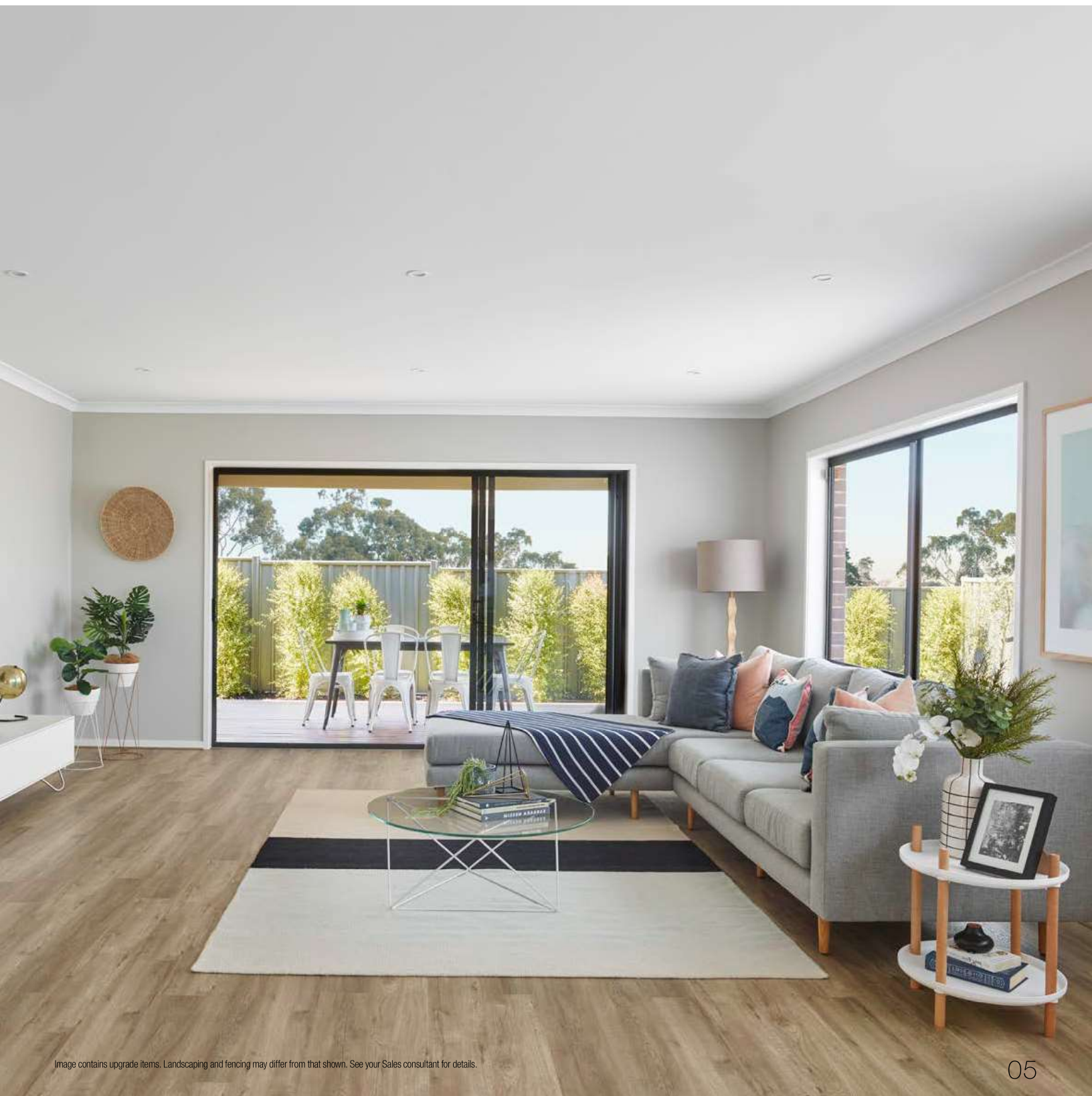
Image contains upgrade items. Landscaping and fencing may differ from that shown. See your Sales consultant for details.