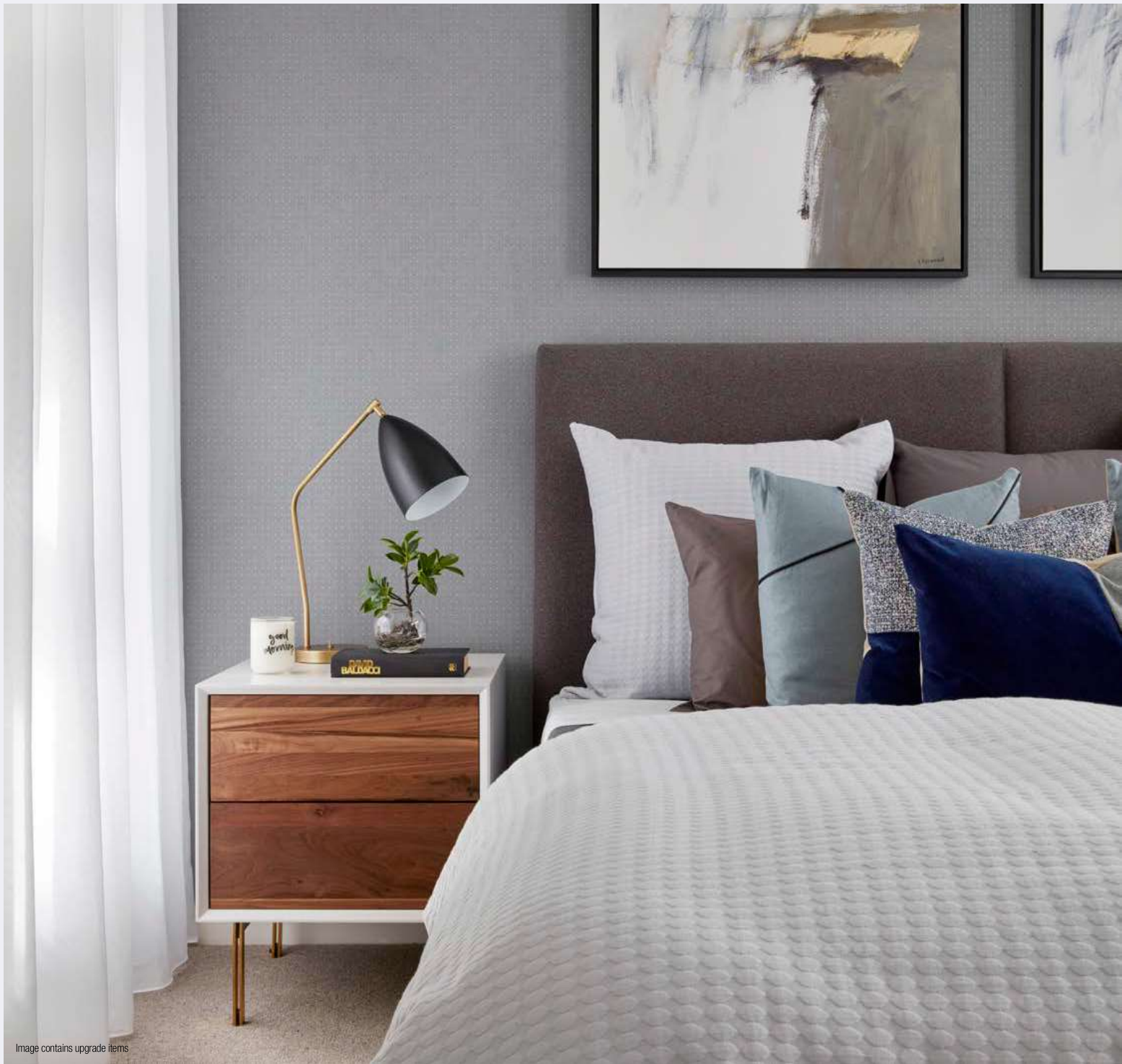
Image contains upgrade items