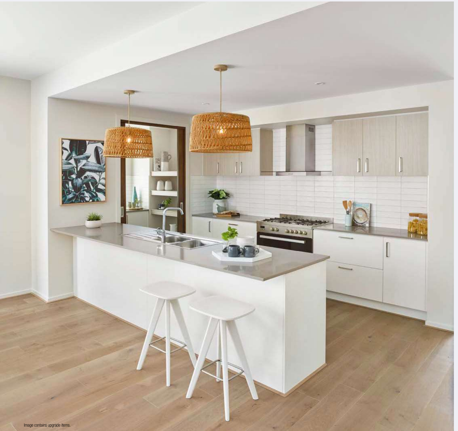
Image contains upgrade items.