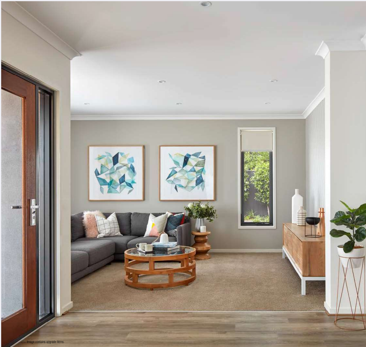
Image contains upgrade items.